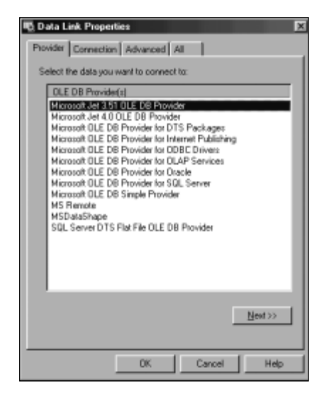
Figure 29-1: Choosing the proper OLE DB Jet provider.